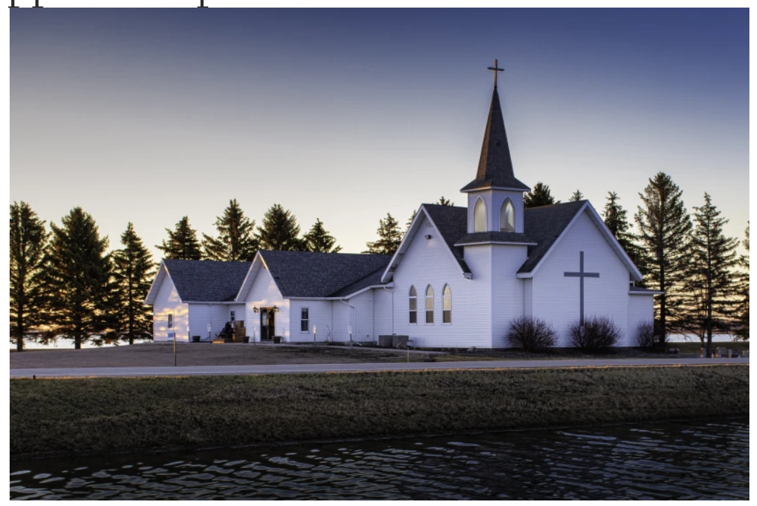
Kongsvinger Lutheran Church, founded 140 years ago, stands in the midst of a sugar beet field between Oslo and Alvarado, Minn.

Kongsvinger Lutheran to host 'American Gospel' presentation at charity event to support campus ministries